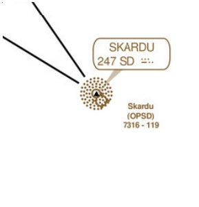
Satellite View of OPSD