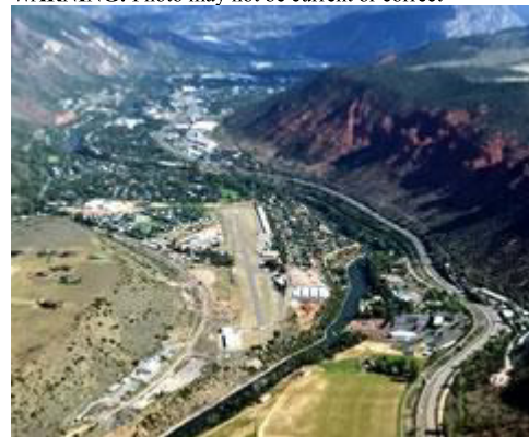
Taken in the Summer of 2017 looking north.

WARNING: Photo may not be current or correct