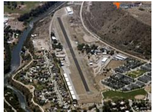
Photo taken 10-Jul-2012 from 11,500' looking south.

Do you have a better or more recent aerial photo of Glenwood Springs Municipal Airport that you would like to share? If so, please send us your photo .